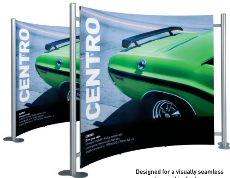
Designed for a visually seamless magnetic graphic display