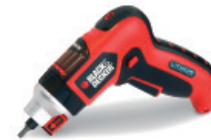
POWER tool kit