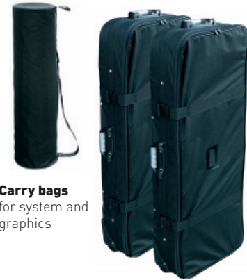
Carry bags for system and graphics