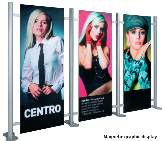
Magnetic graphic display